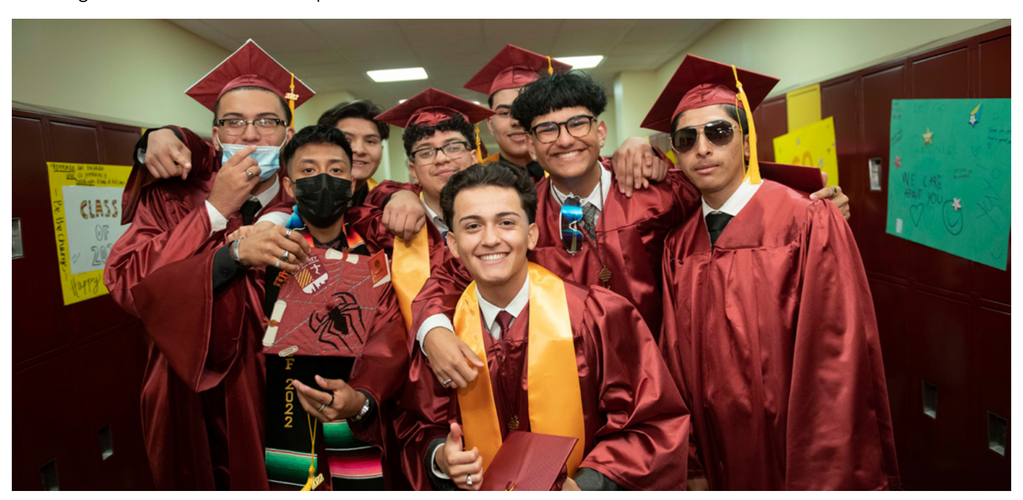
Graduates from Cristo Rey's Class of 2022.

■ Working with LP, Cristo Rey Jesuit students gain valuable job-readiness skills and work experience along with a tuition scholarship.