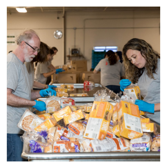
LP team members at the Day of Service in August 2022.

Additionally, since 2019, LP attorneys and paralegals have been working with National Immigrant Justice Center (NIJC) — a non-profit organization dedicated to ensuring human rights protections and access to justice for all immigrants, refugees, and asylum seekers — to provide pro bono legal representation to immigrants in various stages of the asylum process.